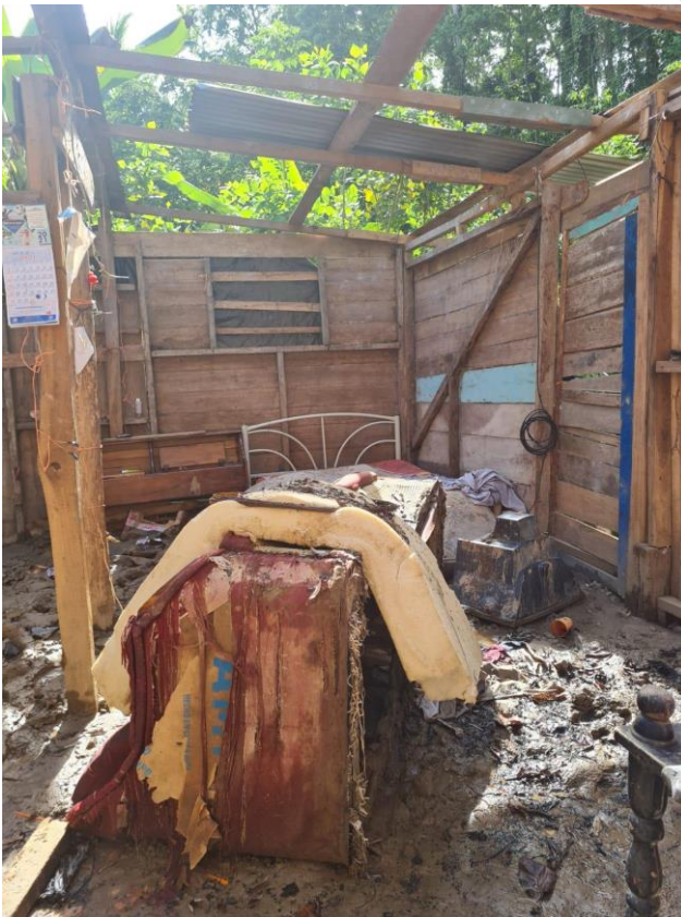
Figure. 3. Flood affectations in Pandora Oeste, July 2021. Source: Author, 2021.

In addition to the historical context and the flood scenarios described, the residents were consulted regarding their experiences with the effects of flooding, the greatest being food loss reported by 79 participants, followed by water supply and infrastructure damage, which were mentioned by 73 and 72 people, respectively. Regarding infrastructure damage, several houses have been damaged, including the one shown in Figure. 3, which was declared a total loss by the National Emergency Commission in 2021, and the property now has restrictive regulations on the construction of any type of infrastructure.