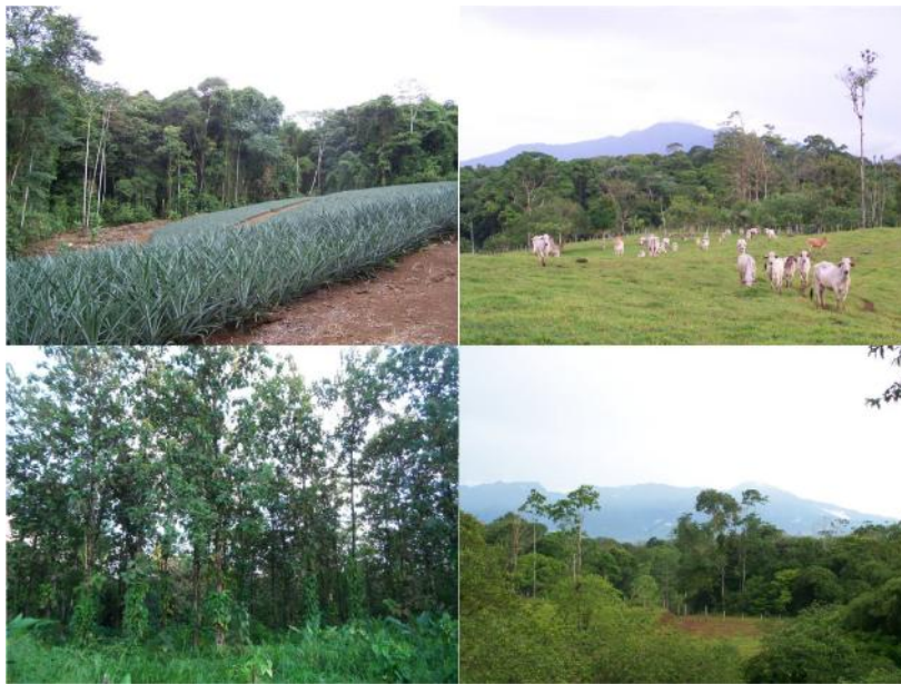
Fig. 2. Four representative matrix land-use types within the San Juan – La Selva Biological Corridor. From left to right: pineapple plantation, cattle ranch, tree plantation, eco-lodge reserve.