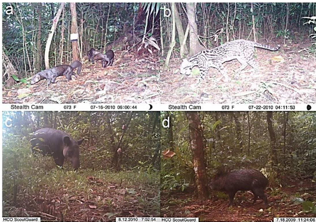
Fig. 3. Photos of two mesopredators, (a) tayra and (b) ocelot, encountered at all four land-cover types, and two large ungulates, (c) Baird's tapir and (d) collared peccary, encountered at land-cover types except pineapple plantations.

It is encouraging that the endangered Baird's tapir was detected at three of the four matrix land-use categories; however, its absence as well as the absence of collared peccary ( Pecari tejacu – Fig. 3) in forests adjacent to pineapple plantations reveals a relative weakness when comparing richness among sites without examining composition. Pineapple production may support many medium mammals, but the fragmentation and edge effects severely limit the habitat for large herbivorous/frugivorous mammals that are often responsible for maintaining natural plant communities [7]. Other influences on herbivores are most likely hunting and poaching pressures. In their study of ungulates in Peru, Licona et al. [32] determined that passive protection from hunters and poachers is mainly due to the inaccessibility of forest reserves. The fragmented nature of the San Juan–La Selva Biological Corridor allows easy access into the forest and may not afford such protection for game species such as collared peccary and paca ( Cuniculus paca ).