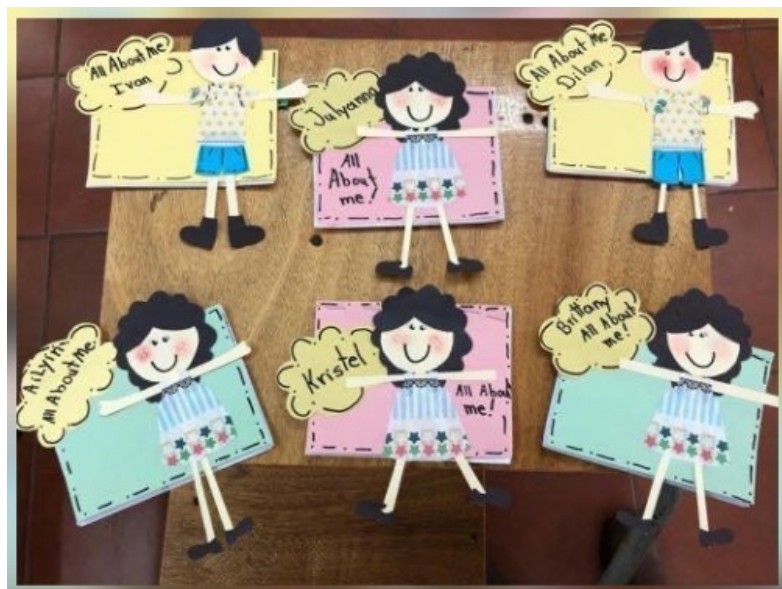
Figure 6 Booklets

Note: Cartoons designed by first-grade students