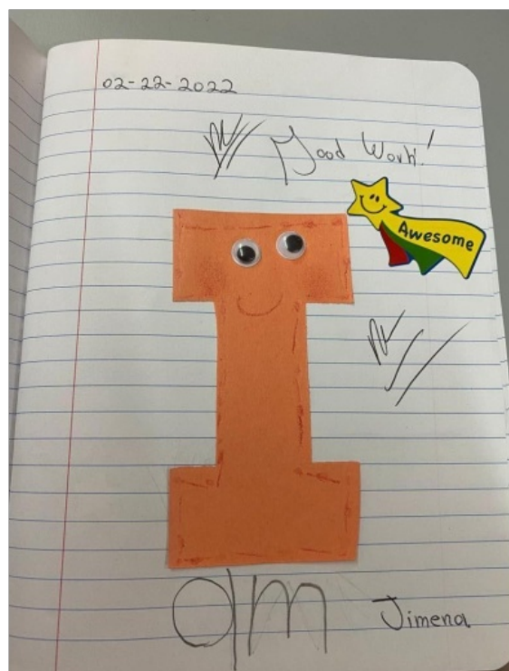
Figure 1 I-Cartoon Character

Note: Cartoon designed by one of the first-grade students