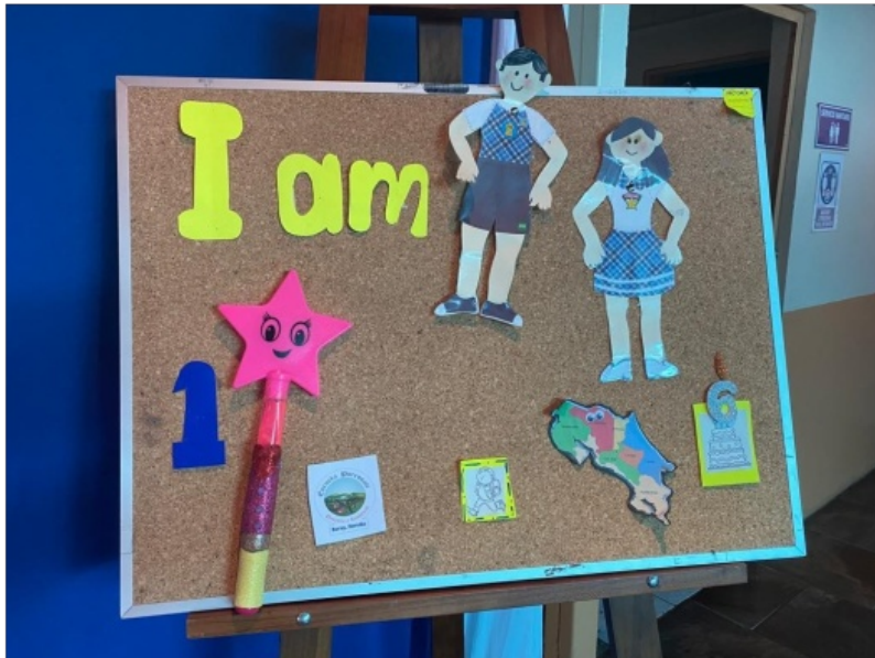
Figure 5 Board Template