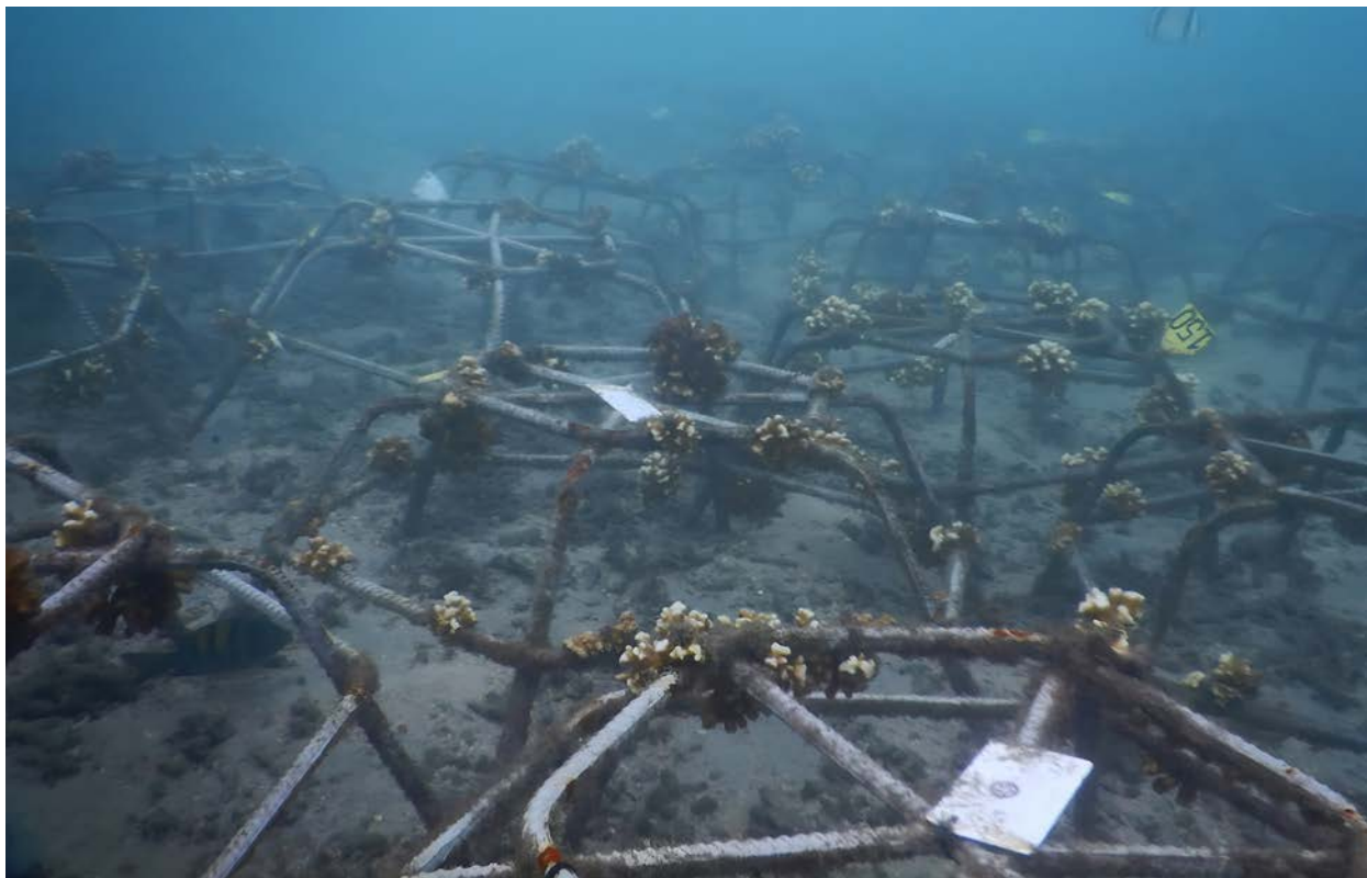
Restoration structures type “araña” in Playa Blanca, Bahía Culebra, Pacific coast of Costa Rica, with fragments of the coral Pocillopora spp. as part of a research project of the Centro de Investigación en Ciencias del Mar y Limnología (CIMAR), Universidad de Costa Rica (Credit: Juan José Alvarado).

Mangrove restoration has focused on the Pacific coast, where most of the country’s mangroves are located. Mangrove areas that have been cleared for agriculture, ponds for shrimp aquaculture and salt production, and for coastal development are key sites for restoration projects. An abandoned shrimp pond on the Pacific coast of Costa Rica at an unspecified location was reported to have undergone a hydrological restoration ten years ago, and the results were a 64% increase in total basal area of mangrove species compared to a control site, yet other sites did not show this level of improvement (Lewis et al. , 2019). A study in the Golfo de Nicoya, Pacific coast, of mangrove regeneration in shrimp ponds that had been inactive for 1-10 yr and 11-20 years showed slow and unpredictable recolonization and development of mangroves and carbon content in the ponds compared to controls (Cordero-Murillo et al. , 2023). This highlights the need for active restoration of hydrological dynamics as part of mangrove restoration initiatives. Carbon stored in mangrove forests has also been known to decrease drastically in Costa Rica (Boone Kauffman et al. , 2017), highlighting the benefits of their restoration for climate change mitigation. Many mangrove restoration initiatives in Costa Rica include propagule growth in “nurseries” and planting of seedlings by community associations and NGOs, the government, and student thesis projects (see Appendix for additional references).