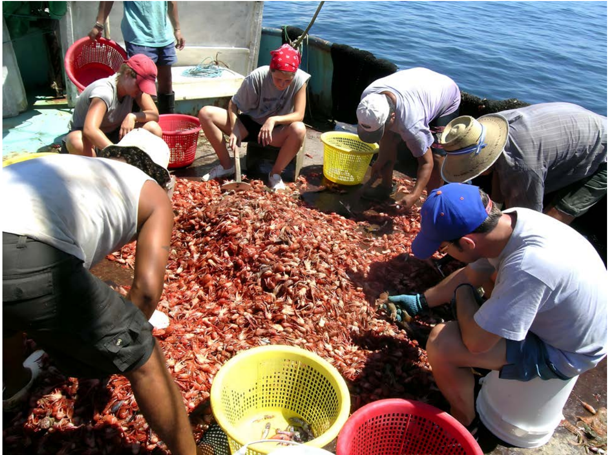
Collaboration of students, invited researcher from Brazil and the crew members of the commercial shrimp trawler "Onuva" as part of a Public-Private-Partnership Project lead by the Unidad de Investigación Pesquera y Acuicultura (UNIP) of the Centro de Investigación en Ciencias del Mar y Limnología (CIMAR), Universidad de Costa Rica.