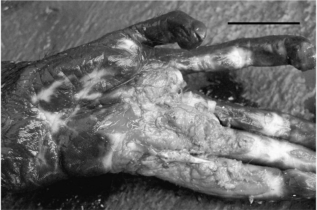
FIGURE 1. Skin with necrotic ulcerative dermatitis of upper limb. Bar = 3 cm.