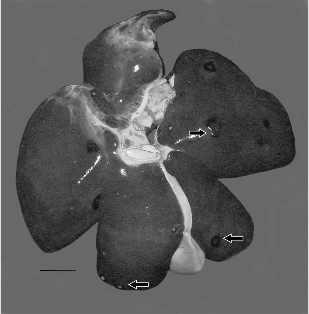
FIGURE 3. Liver showing diffuse foci of white spots surrounded by hyperemia. Bar = 1 cm.

Gross lesions observed during necropsy revealed loss of epidermis and ulceration with necrotic areas surrounded by a yellowish substance in mouth, tail, and palms and fingers of upper limbs (Fig. 1). The liver had multiple focal white foci, 0.2 to 2 cm in diameter, which were surrounded by red halos on the liver capsule and in the parenchyma (Fig. 2). Generalized enlargement of the lymph nodes was observed as well. Other organs did not have any obvious alterations or lesions.