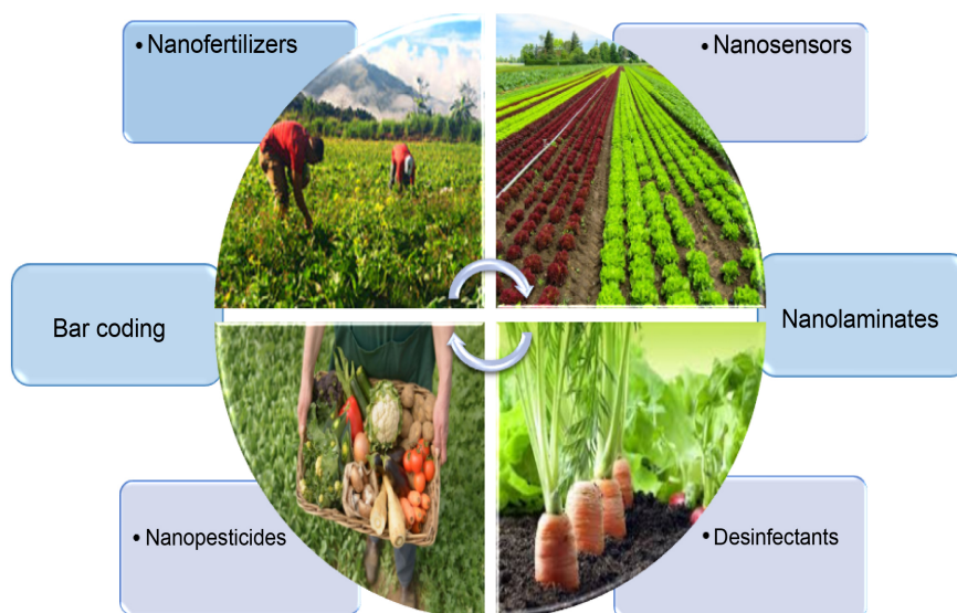
Figure 2. Some applications of Nanobiotechnology in the agricultural sector.

nanotechnology present great advances in the use of resources, reduction of environmental impact and search for environmentally friendly technologies.