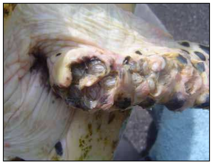
Figure 4. Stephanolepas muricata in the rear flipper of a hawksbill.