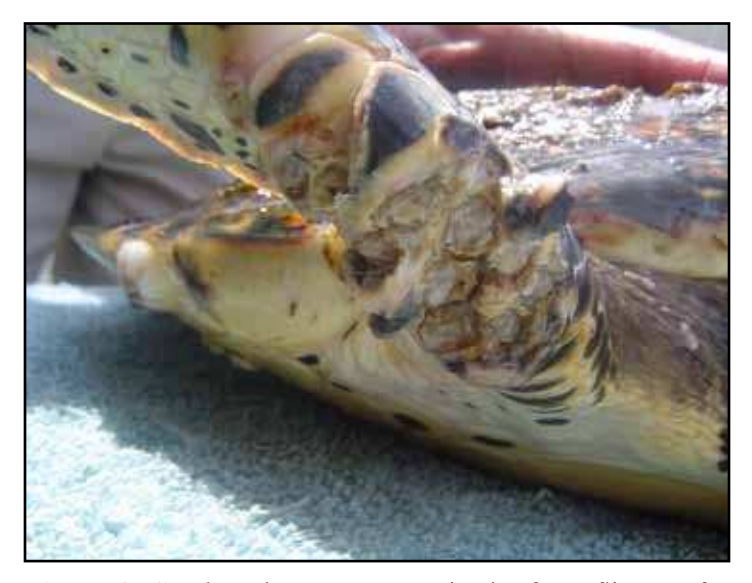
Figure 3. Stephanolepas muricata in the front flipper of a hawksbill.