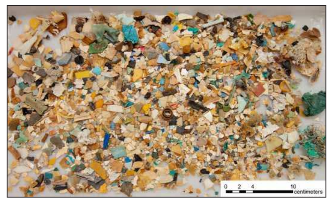
Photo of anthropogenic debris (>3200 pieces) found in the large intestine of a small juvenile green turtle that was found stranded in southern Brazil (see pages 6-8).