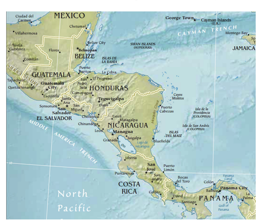
Figure 1. Geographic region known as Mesoamerica incudes Southeastern Mexico, Guatemala, Belize, El Salvador, Honduras, Nicaragua, Costa Rica, and Panama. Image adapted from the CIA World Factbook map of Central America. 12

Three international workshops have been conducted in Central America since 2005, under the auspices of the Program on Work, Health and Environment in Central America (SALTRA),<sup>26-28</sup> as well as the National Autonomous University of Mexico.<sup>27</sup> Much of this review is based on the discussions and results of these workshops, especially the First International Research Workshop on the Mesoamerican Nephropathy, held in November 2012 in San José, Costa Rica.<sup>28,29</sup> The epidemiologists, clinicians, and public health professionals who participated in the workshops emphasized that this disease does not follow expected patterns of usual or commonly known kidney disease, such as kidney disease linked to diabetes or hypertension. Instead, they confirmed