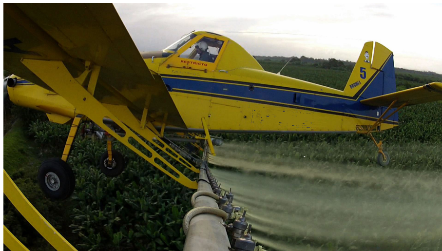
Figure 1. Aerial application of mancozeb at banana plantations in Costa Rica.

Study procedure. Women were interviewed in their homes one to three times during pregnancy depending on gestational age at enrollment. Mean ( \pm SD) time between first and second, and second and third, visit was 10.6 \pm 4.0 and 9.6 \pm 3.6 weeks, respectively. A urine sample was obtained at each visit. During the visits blood and hair samples were also collected; results from these samples have been reported elsewhere (Mora et al. 2014). In addition, clinical information was abstracted from the Prenatal Health Card, which is provided to pregnant women by the Costa Rica Social Security (CCSS) and is completed by physicians and nurses at each prenatal care visit. Gestational age at day of visit was calculated on the basis of the first day of the last menstrual period (LMP) as reported by each woman. When LMP was unknown ( n = 18 ), gestational age was based on ultrasound ( n = 5 ) or physicians report (fundal height, n = 10 ). Three women lacked information on gestational age and were excluded from data analysis. An additional three women did not provide a urine sample. We obtained 872 urine samples from the remaining