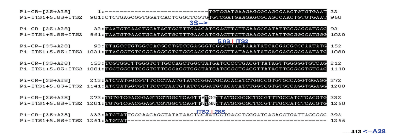
Figure 2. Alignment of the ITS2 region sequences of Platynosomum illiciens.

Note. A and B, respectively, obtained from the gallbladder and hepatic parenchyma of the cat stained in carmine.