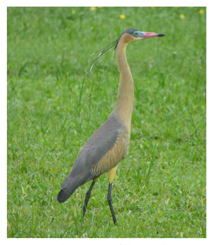
Figure 2. Syrigma sibilatrix in the soccer field at Manzanillo, Limon province, Costa Rica, 16 February 2016.

2012). However, a gradual expansion in its range could be occurring, possibly associated with habitat loss by agriculture, as well as other human-induced landscape changes (Blamires et al. 2005; Dean 2012).